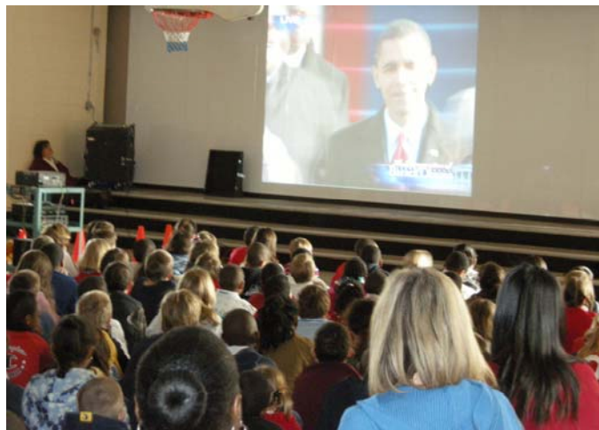
Students and staff at Churchill School listen attentively as Barack Obama takes the oath of office.