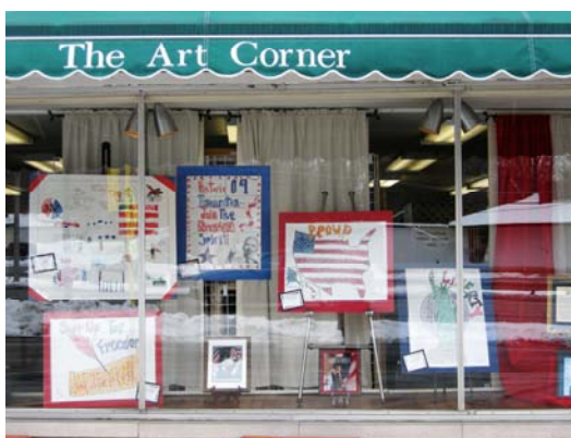
Above, Homewood's The Art Corner devoted their entire front window to displaying inauguration-themed posters created by district students.